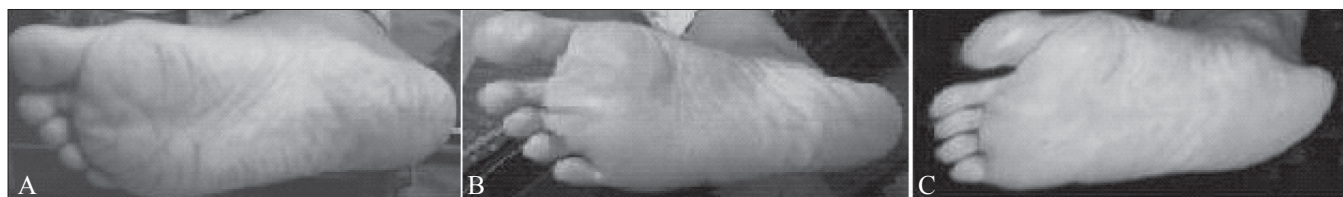
Fig. 1: Photographs showing clinical efficacy of foot care cream. A, B and C represent clinical conditions on 0 d, after 4 w and after 8 w period, respectively.

Overall, mango butter has a high potential to yield excellent emolliency which rebuilds a naturally